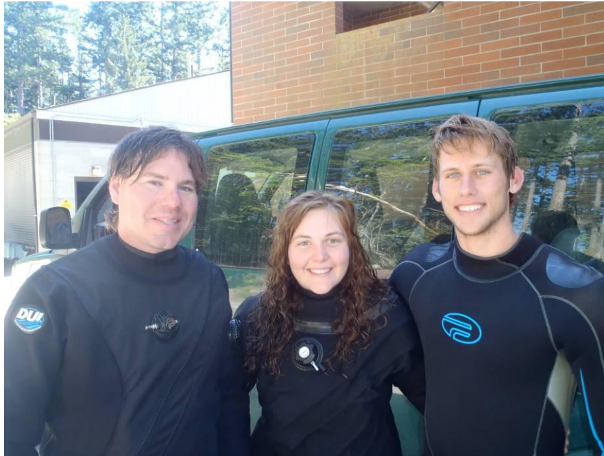
This was taken just after our last dive (check out that drysuit!)