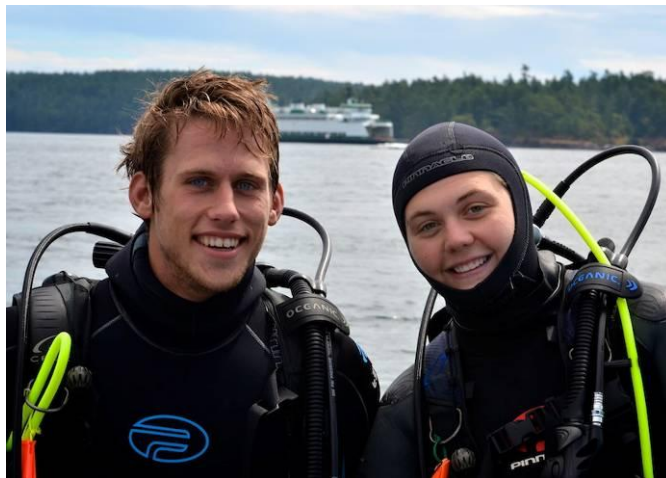
My diving "class"