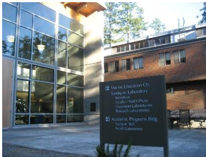
Front entrance of SPMC

The primary goal of the OWUSS/AAUS Scientific Diving Internship is to provide an intern with the experiences necessary for a future in science, diving for research, or other scientific diving related field. The intern achieves this by receiving training through an AAUS Organizational Member and completing their scientific diving certification. Located in Anacortes, Washington, Shannon Point Marine Center of Western Washington University was selected as the host site for the internship in 2011. During my stay I got to live in the dorms at the marine center with SPMC's summer 2011 REU students while working my way through the scientific diving certification.