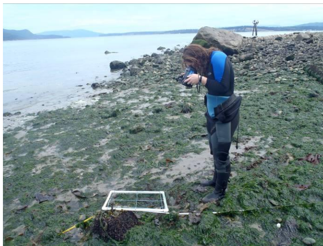
DNR survey at low tide