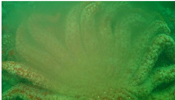
Pycnopodia helianthoides , a helpful tool for collections

By far the star of the summer was our research with native Pinto abalone. The Puget Sound Restoration Fund (PSRF) and the Washington Department of Fish and Wildlife (WDFW) funded two days of brood stock dives where we collected solitary, reproductively isolated adult abalone for hatchery efforts. These were some of the most interesting dives we did, lots of beautiful habitat and kelp forest canopies.