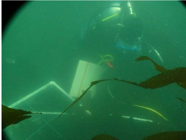
Laying the same DNR transect for the underwater surveys