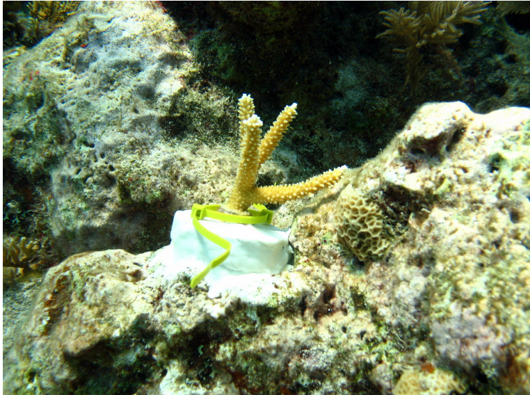
Stag Horn Coral Restoration Part V: Measure and record size data of new coral.