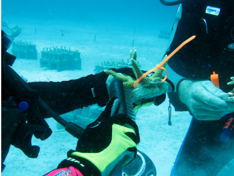
Stag Horn Coral Restoration Part I: Cleaning the coral base in preparation for transport.