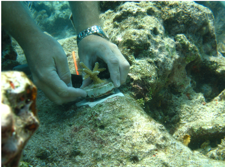
Stag Horn Coral Restoration Project Part IV: Epoxy coral to restoration site.