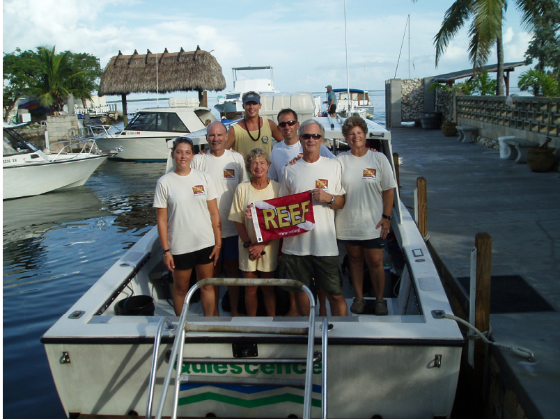
REEF AAT members participating in the Upper Keys Monitoring project.