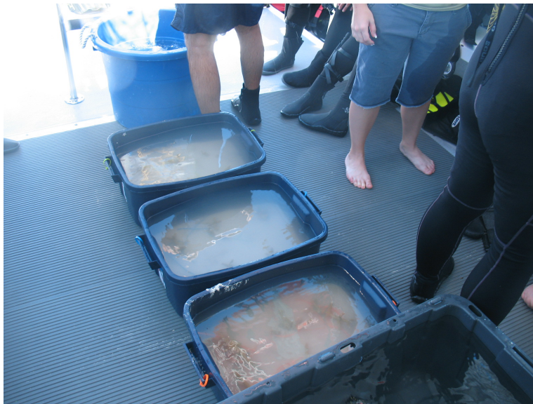
Stag Horn Coral Restoration Project Part II: Transporting corals to restoration site.