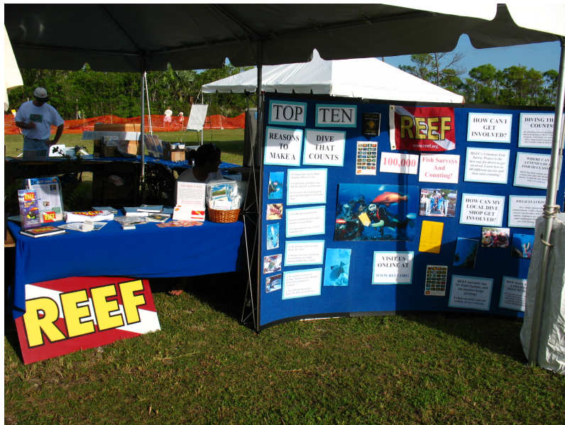
REEF information booth at the Native Plant Fair.