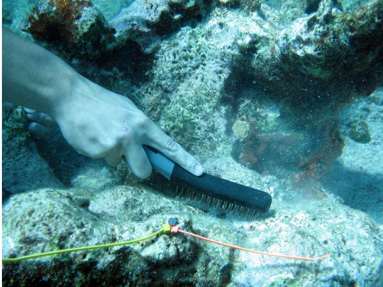
Stag Horn Coral Restoration Project Part III: Preparation of site to receive coral transplant.