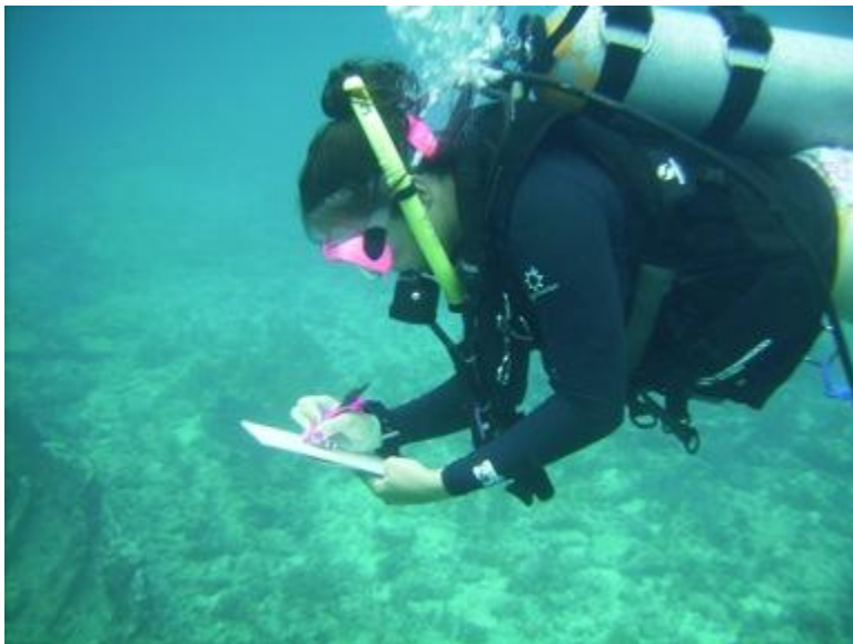
Doing a REEF fish survey

As I got started at REEF, I noticed that the 'Intern Survival Kit' could use some updating. REEF relies heavily on interns, who switch out three times a year. I personally hate to bother people with miscellaneous questions I know they have been asked before so I decided to create an intern guide of all the things I had to ask about. I hope this resource