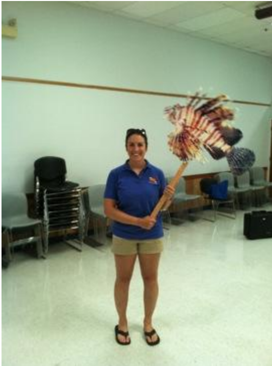
At a lionfish workshop with our sample lionfish