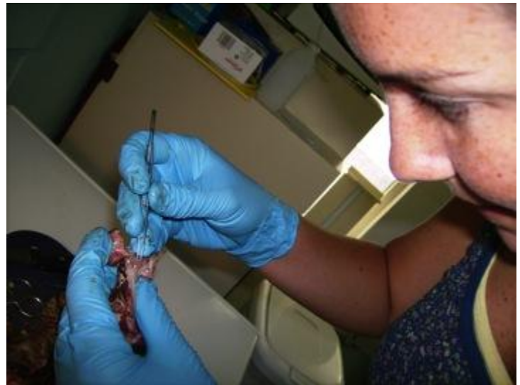
Removing the otoliths