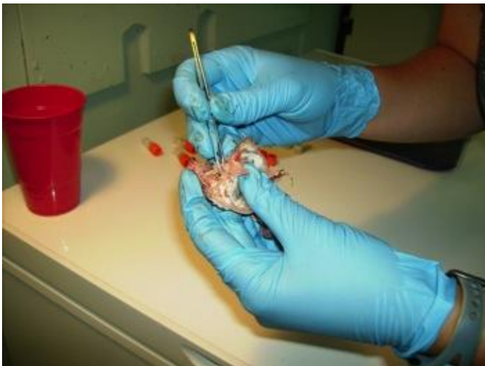
Removing the otoliths