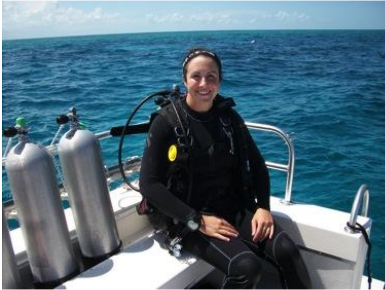
Preparing to do a fish survey

REEF office in no time. Learning fish also started immediately and after my first week I took the first fish ID quiz and became a REEF Level two surveyor.