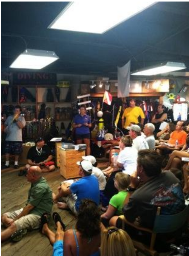
Teaching a fish ID course to the Miami-Dade Reef Guard Association

As part of the GAFC, I also represented REEF and taught a fish ID course in Miami for the Miami-Dade Reef Guard Association. This group focuses on protecting the reefs around Miami and does annual monitoring of the wreck trek sites off of Miami Beach. I taught their volunteer surveyors basic fish ID's and joined them on their survey dives. This group was very excited to learn fish and put their skills to use and diving in Miami was great! GAFC events kept me busy in July but I was able to meet many great people and encourage them to survey and submit data to REEF's database.