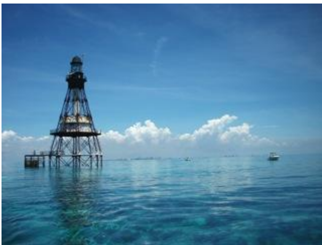
One of our snorkel spots while volunteering with Biscayne National Park

people and learned about their work, but the visibility and calmness of the water was simply amazing. The water was crystal clear and looking off in the horizon you could not even tell where the ocean stopped and the sky started. It was also an interesting day because, after spending the previous two summers doing interpretation work with the National Park Service, it was great to see what other divisions of the NPS do and visit a park that was created to preserve amazing marine resources.