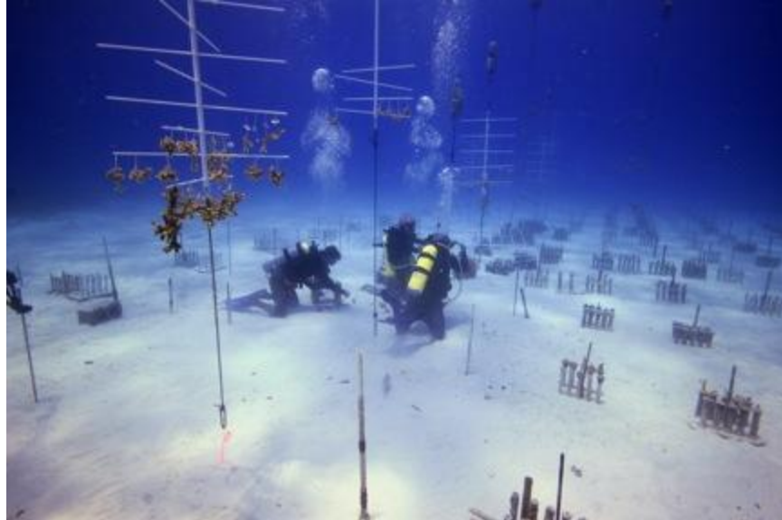
The CRF nursery

Walking on the seafloor is a unique feeling and being able to just jump up and float in the water is able as close to flying or walking on the moon one gets here on Earth.