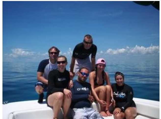
Biscayne NP Biological Science Technicians and other volunteers

Although these experiences were great, I think my favorite volunteering days were the ones I spent with the Coral Restoration Foundation. This organization is a non-profit based in Tavernier, Florida that works to restore the Acropora cervicornis , or staghorn coral, population in the Keys. This coral is endangered and threatened by the many challenges facing our reefs today including global warming, ocean acidification, and irresponsible anchoring (among other things!). CRF maintains a coral nursery with over